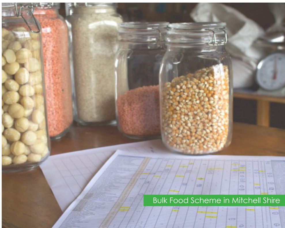
Bulk Food Scheme in Mitchell Shire

Sounds simple, but this will do wonders for our health and food budget.