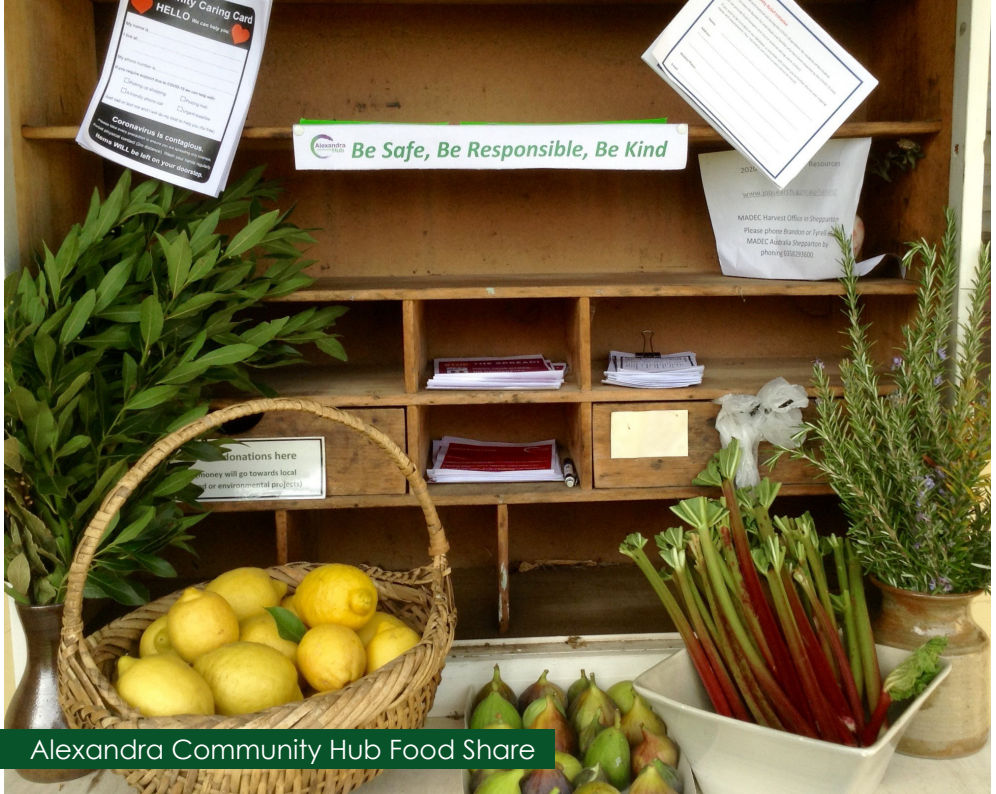
Alexandra Community Hub Food Share